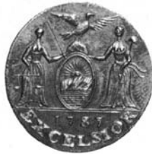
New York State Cent (1787)