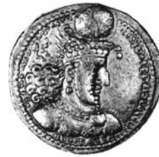
The American Numismatic Society Persian Dinar (A.D. 303 to 309)