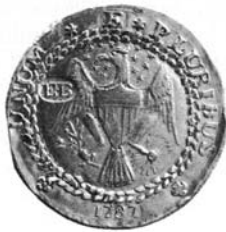
The American Numismatic Society Brasher's Doubloon (1787)