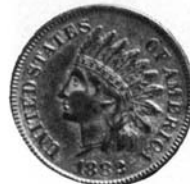
Indian Head Cent (1882)