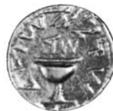
Judean Shekel (A.D. 66 to 70)