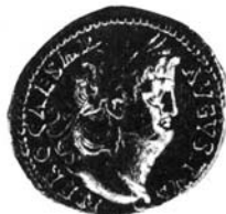
Roman Coin (A.D. 54 to 68)