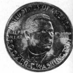
Booker T. Washington Commemorative Half Dollar (1946)