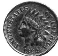
Indian Head Cent (1882)