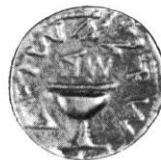
Judean Shekel (A.D. 66 to 70)