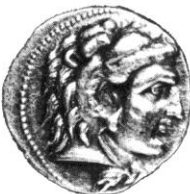
Macedonian Tetradrachm (336 to 323 B.C.)