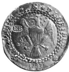
The American Numismatic Society Brasher's Doubloon (1787)