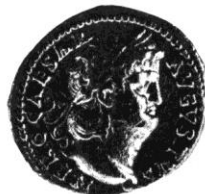
Roman Coin (A.D. 54 to 68)