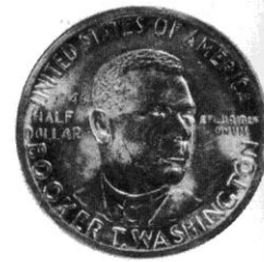
Booker T. Washington Commemorative Half Dollar (1946)