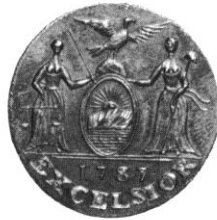
New York State Cent (1787)