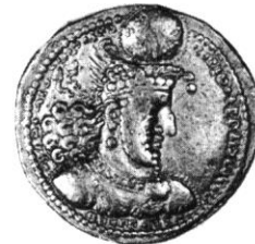
The American Numismatic Society Persian Dinar (A.D. 303 to 309)